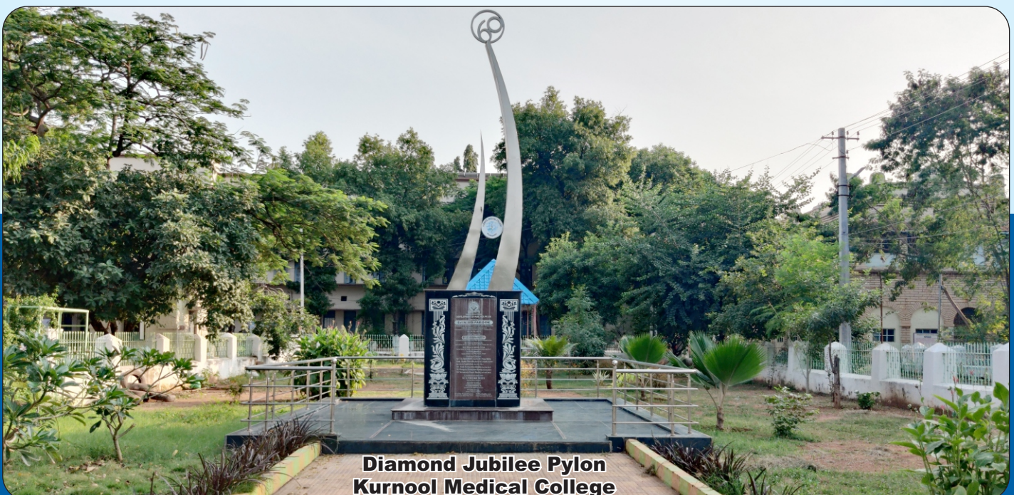
Diamond Jubilee Pylon Kurnool Medical College